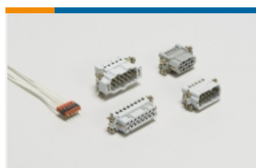
Rectangular Contact Inserts(8)