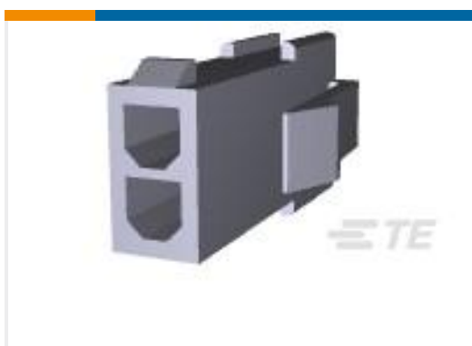
TE Part #1-172157-9 2CIR MINI U-M-N-L CAP BLCK