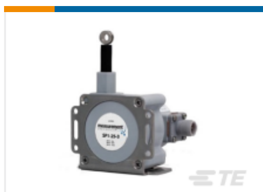
TE Part #SP1-50-3 STRING POT 50 INCH RANGE