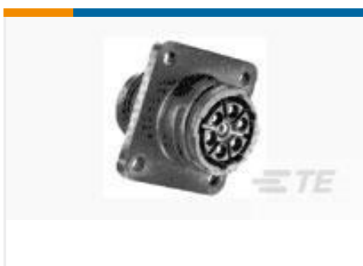
TE Part #211398-3 CPC RECPT. SIZE 13-7