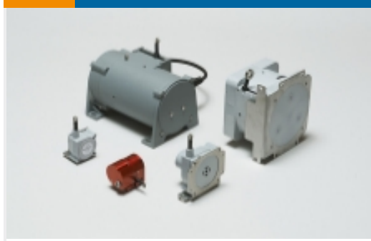
Cable Actuated Position Sensors(22)