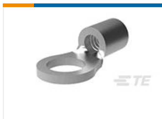
TE Part #8-34109-1 SOLIS R 22-16 COMM 22-18MIL 10