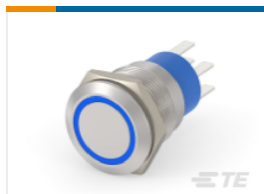
TE Part #5-2213767-9 AV19 DPM 5A MOVE RING LED BLUE 24V