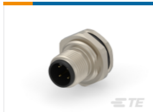
TE Part #T4171010004-001 M12,REAR MOUNTING,MALE,A,4P,0.2 M WIRE