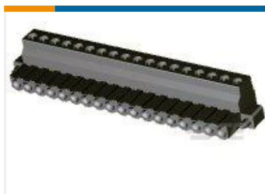
TE Part #796858-3 3 POS TERMI-BLOK PLUG RT ANGLE