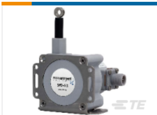
TE Part #SPD-50-3 STRING POT 50 INCH RANGE