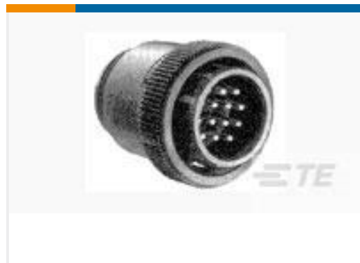
TE Part #206429-1 CPC PLUG ASSY, 11-4, REV SEX